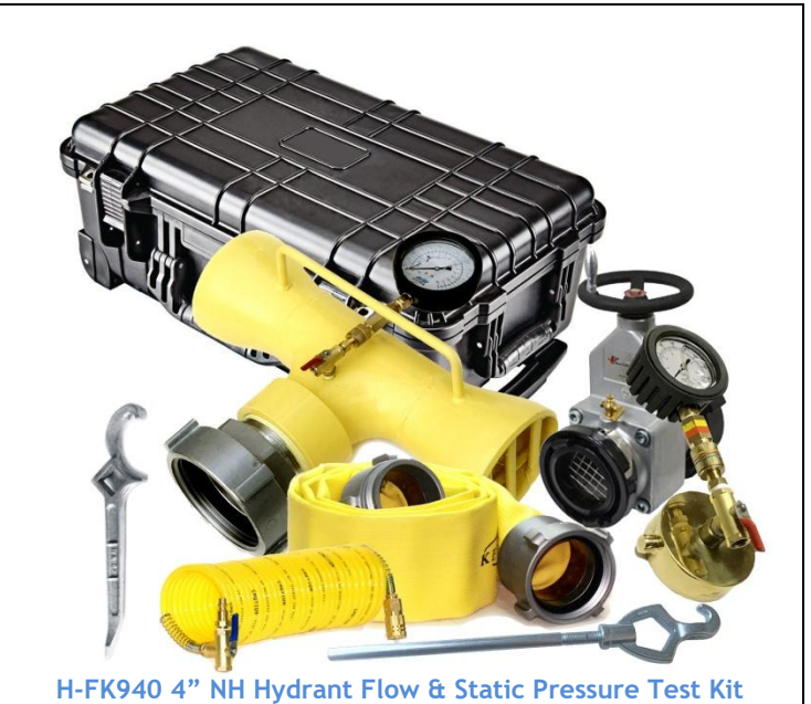
H-FK940 4" NH Hydrant Flow & Static Pressure Test Kit