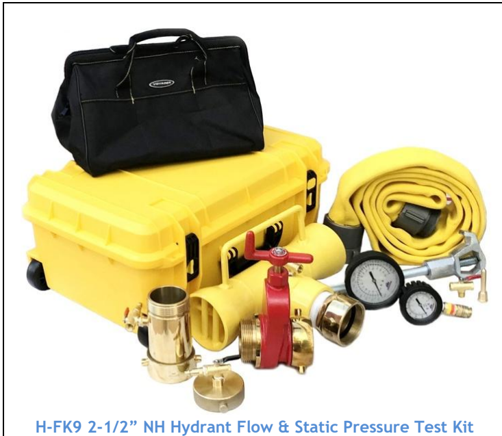
H-FK9 2-1/2" NH Hydrant Flow & Static Pressure Test Kit